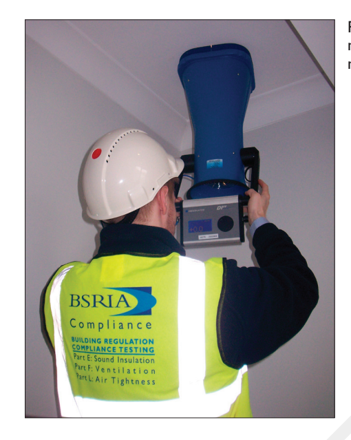
Powered flow hood, used for measuring flow rates from mechanical ventilation systems